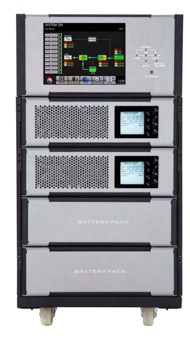
Complete Arena Series with Chassis, Power Module and Battery Module Front View (Left). Stand Alone Arena Power Module (Bottom).

Perfect for critical applications, this feature ensures users with a high output performance from the UPS at a high power efficiency (up to 97% with output power factor 1.0).